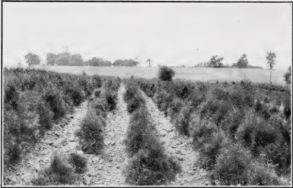
Thuja Occ. Pyramidalis , 8 to 12 in.

(THUJA) occidentalis vervaeneana. Vervaene Arborvitae Graceful, bronze, mottled tree for many uses.